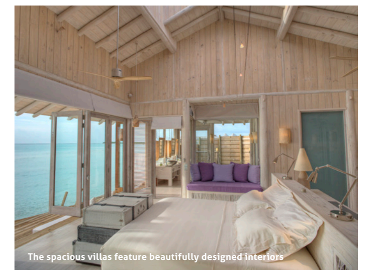
The spacious villas feature beautifully designed interiors