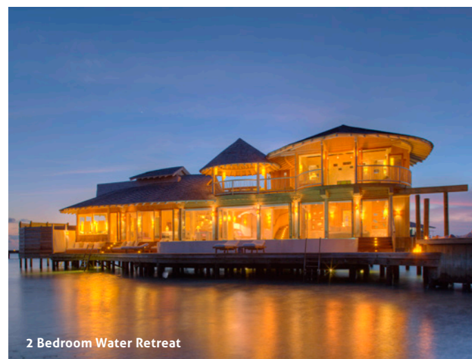
2 Bedroom Water Retreat

Set within The Gathering, Soneva Spa's view of the shimmering lagoon sets the tone for soul therapy. Choose from a menu of holistic and traditional treatments conducted by highly skilled therapists using all natural products or indulge in one of the signature journeys. Spa treatments are complemented by the fully-equipped gym and yoga pavilion as well as sauna and steam rooms.