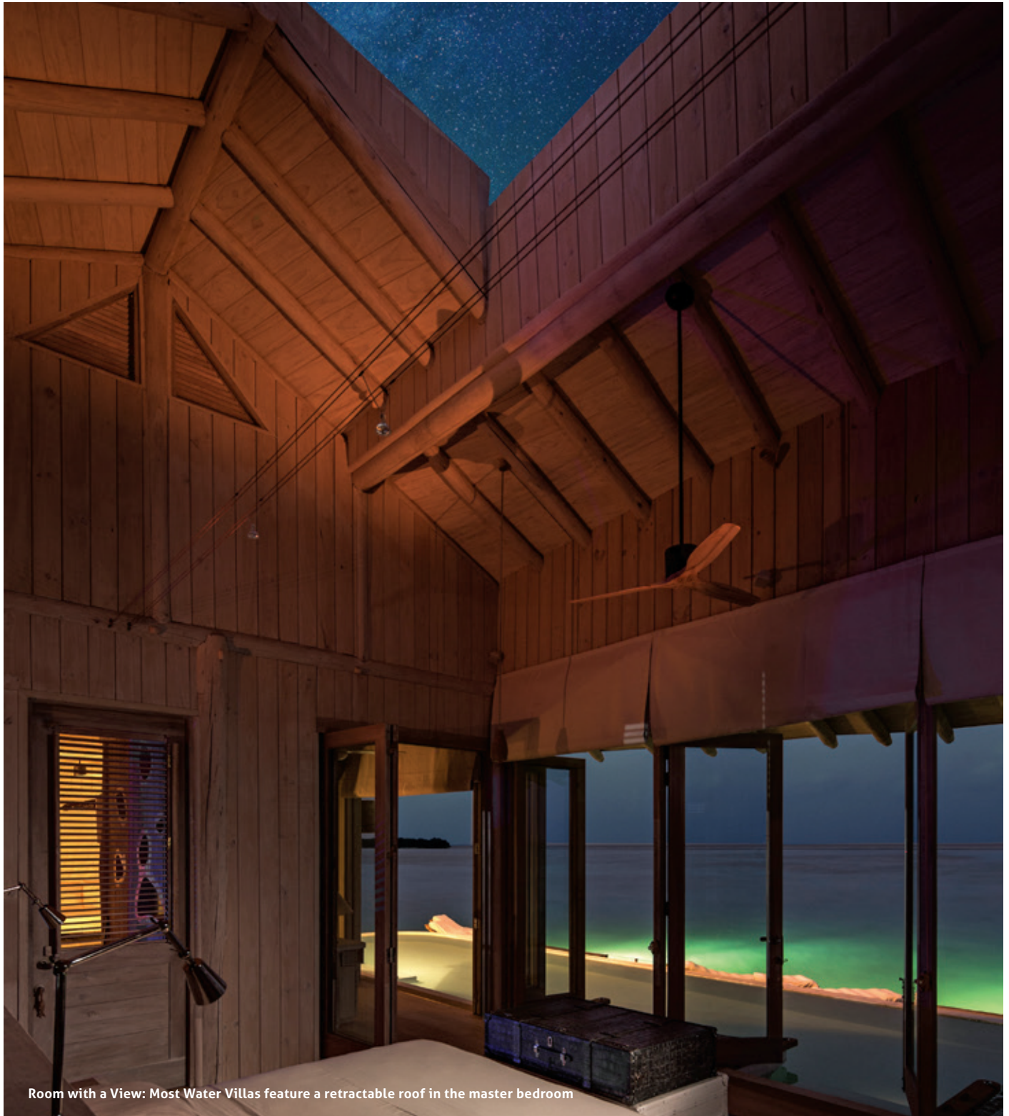
Room with a View: Most Water Villas feature a retractable roof in the master bedroom

The resort is where the embrace of nature is enhanced by the caress of luxury. Guests will be treated to a unique 'castaway' experience within the spacious villas, which feature beautifully designed interiors made from the highest quality sustainable materials.