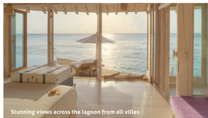
Stunning views across the lagoon from all villas