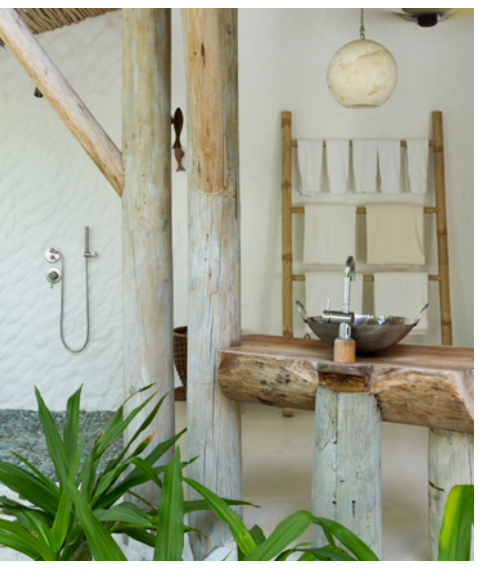
More images: http://www.soneva.com/soneva-fushi/villas/jungle-reserve/